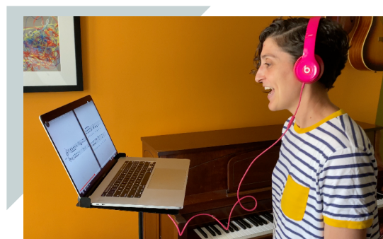
A singer wearing Headphones attached to the Guide Device