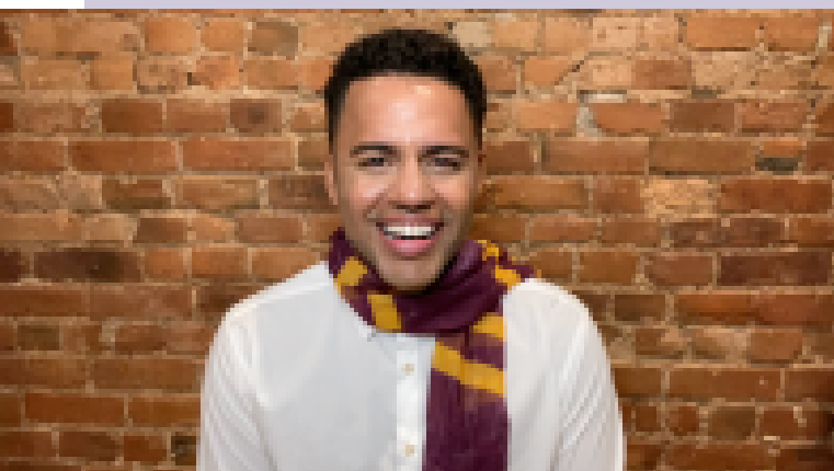
An example of a well-framed, well-lit landscape shot.

Let your enthusiasm show! It makes a big difference. If you find yourself getting tired or frustrated, take a break, and come back refreshed to record a new video.