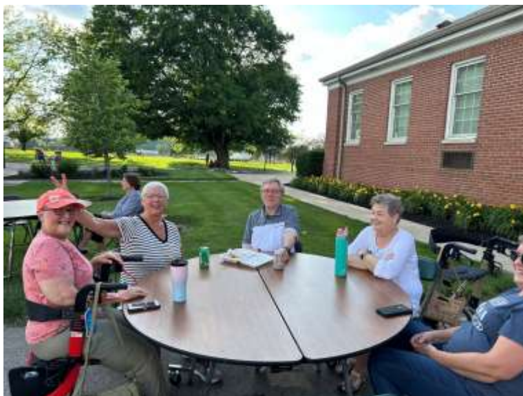
Food Truck Fridays are a great way to hang out with friends and meet new friends. Join the fun, and have some yummy food!

First, Food Truck Fridays . While at first glance this does not seem like a Discipleship opportunity, it definitely is! On the third Friday of the month, from May thru September, we will host food trucks from 6:00pm-8:00pm in our parking lot off of City Center Drive. Each month we give away one hundred meal tickets to our neighbors who shop at the food pantry. In June, we had MANY guests come and join us! The hope is that members of our congregation sit around a table and share a meal with someone they may not know, share a little about your faith journey, offer a listening ear, offer to sit with someone during worship the next Sunday. Trust me, if you open your mind and heart to getting to know someone new and intentionally discern where God was present, discipleship and evangelism are happening.