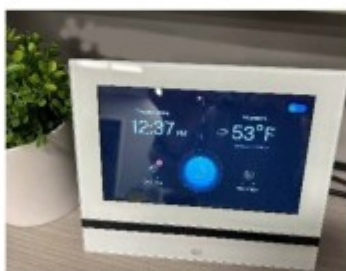
A/I system monitor in office

The Preschool staff extend their heartfelt thanks to all who have contributed to the Ruth Lindsey Fund. Your generosity has had a direct and meaningful impact—thank you for helping to keep our children safe and our community strong.