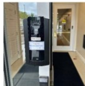
Outside Preschool Door 6