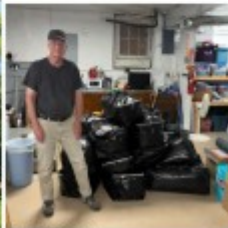
CUMC Coats were delivered to the Henderson Thrift Shop!

We are still working on weaving plarn sleeping mats for Soups On and need your help we have 3 done out of 10 needed. You can join us at Independence Village July 9 th & 23 rd 10:30-11:30, come weave at the church Thursday July 16 th at 10:30am or Friday July 31 st at 10:00am.